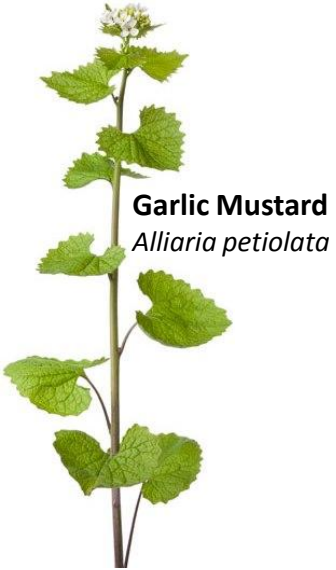
Garlic Mustard Alliaria petiolata