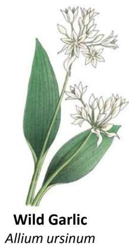
Wild Garlic Allium ursinum