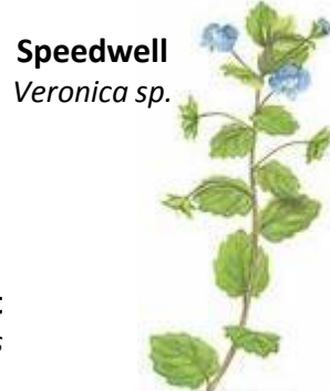
Speedwell Veronica sp.