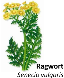
Ragwort Senecio vulgaris