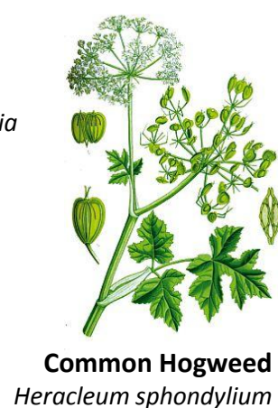
Common Hogweed Heracleum sphondylium