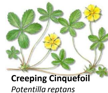
Creeping Cinquefoil Potentilla reptans