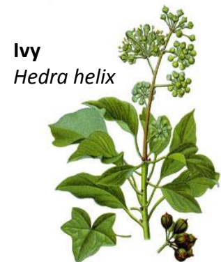
Ivy Hedra helix