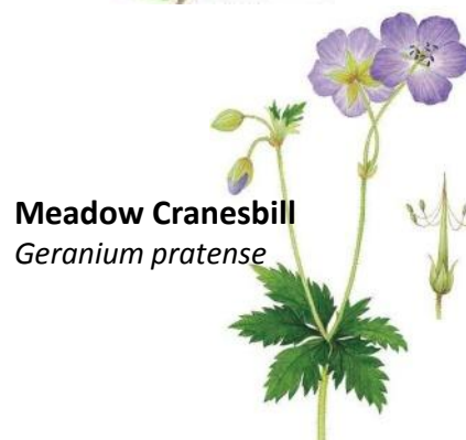
Meadow Cranesbill Geranium pratense