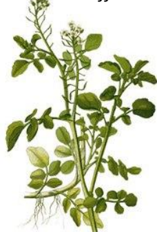
Watercress Nasturtium officinale