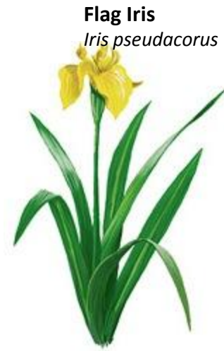
Flag Iris Iris pseudacorus