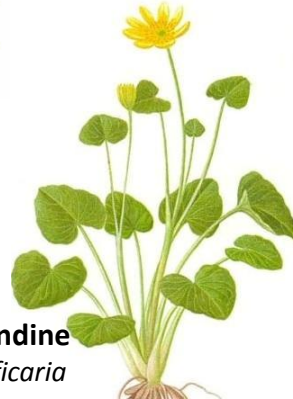
Lesser Celandine Ranunculus ficaria