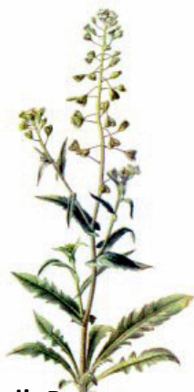
Shepherd's Purse Capsella bursa-pastoris