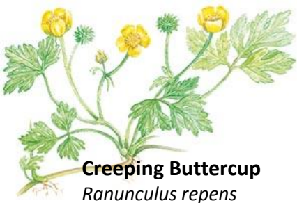
Creeping Buttercup Ranunculus repens

Some species you may see around St. Katharine's Park